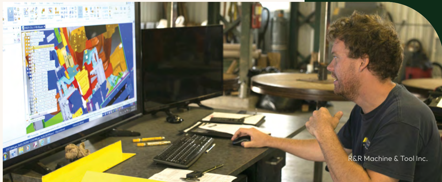
R&R Machine & Tool Inc.