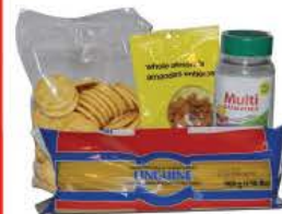
Crinkly, Non-stretch Wrap, Packaging and Bottle Seals