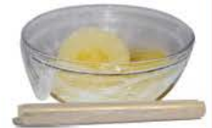
Stretch Cling Wrap