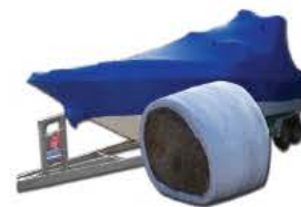
Agricultural Bale, Boat and Shrink Wrap