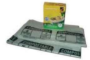
Biodegradable or Compostable Plastics