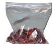
Zipper Lock and Resealable Bags

NO DUMPING, PLEASE. HELP KEEP THE OPERATING COSTS DOWN.