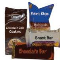
Chip, Cookie, Chocolate and Snack Bar Wrappers