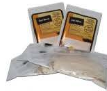
Packaging in Contact with Meat