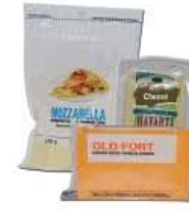
Packaging in Contact with Dairy